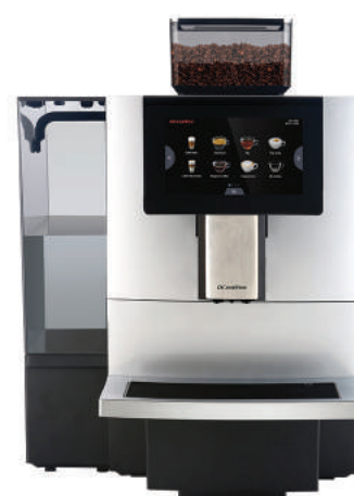
F11 Big / Big Plus (8L Water Tank)