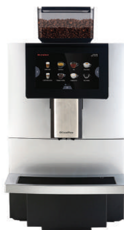
F11 Plus (2L Water Tank)