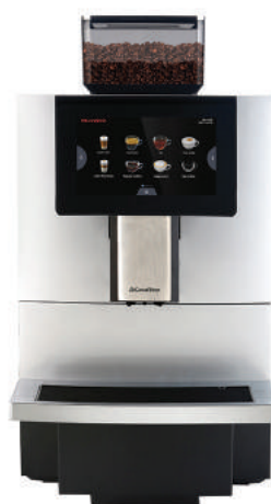
F11 Plus (2公升水箱)