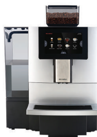
F11 Big / Big Plus (8公升水箱)