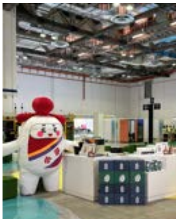
moutai x noomoo poptoy show 2024