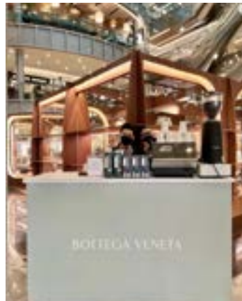
bottega veneta pop-up @ paragon