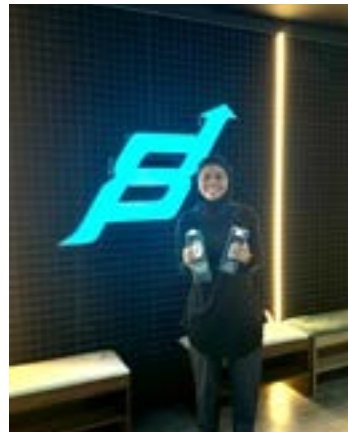
elev8 gym x noomoo gym opening