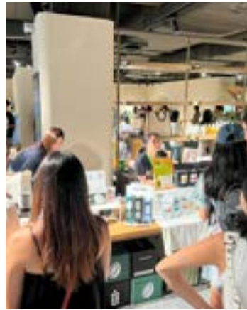
green house event @ castlery