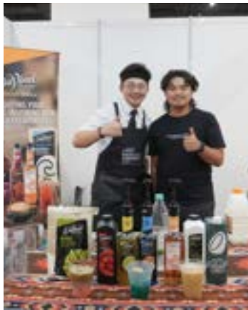
davinci x noomoo terengganu coffee fair