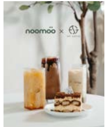
est coffee x noomoo cafe collab