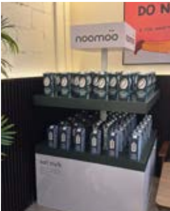
breakroom x noomoo cafe collab