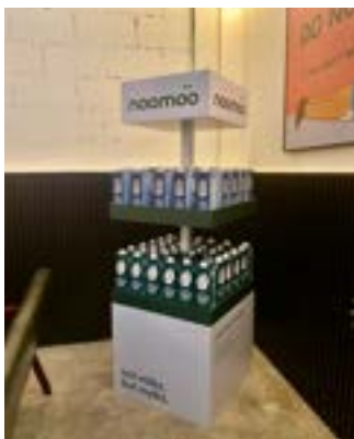
product display shelf