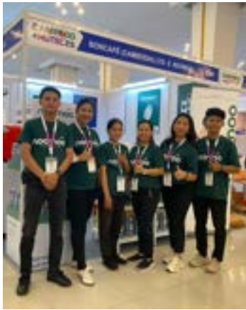
boncafe cambodia x noomoo camfoods & hotel 2025