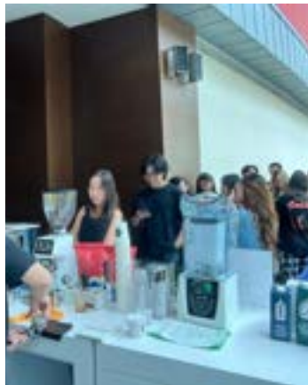
singapore management university sports day