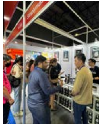
thafx horec asia