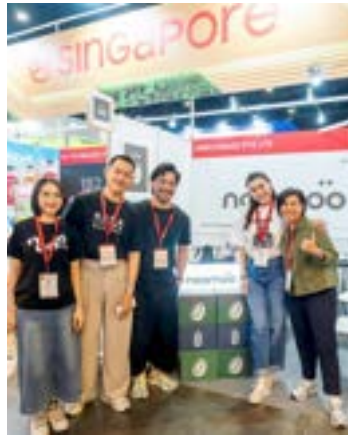
nana coffee roaster x noomoo thaifex anuga 2025