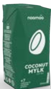
not grandma's santan