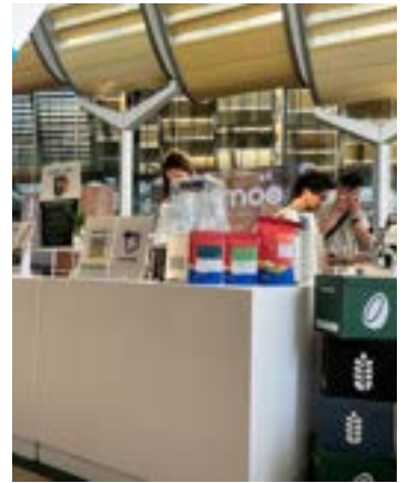
sustainable xmas for underprivilege kids