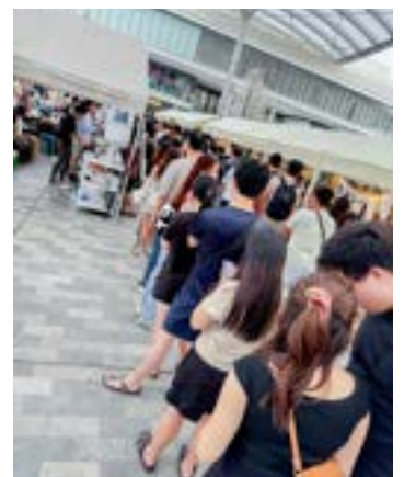
pingmin coffee festival @ pavilion bukit jalil