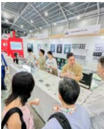
food & hotel asia singapore