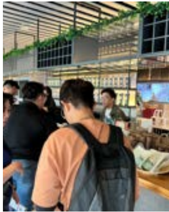
raffles medical group wellness launch