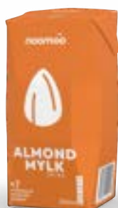
nutty but classy