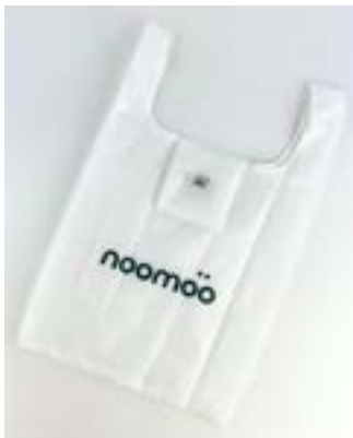
foldable recycle bag