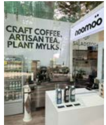
noomoo @ one george street