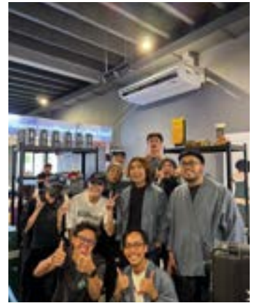
tampd coffee x noomoo coffee convention brunei 2025