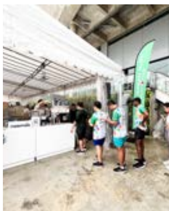
great green run for sustainability singapore