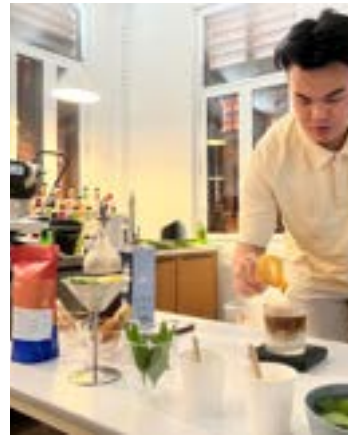
forest cloud x noomoo mixology session