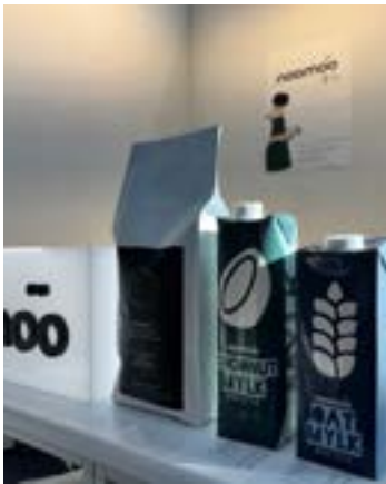
black soul coffee x noomoo seoul cafe show 2024