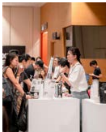
coexist coffee fair