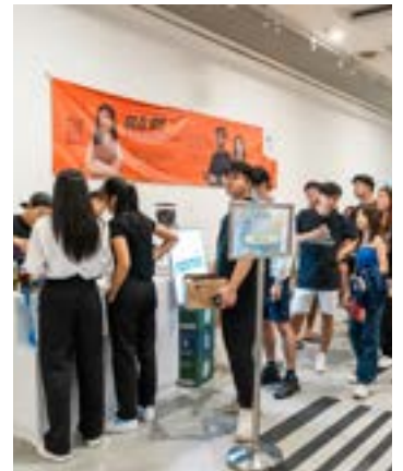
singapore management university x noomoo welfare day