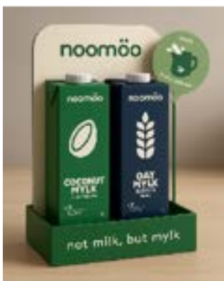
cafe counter display