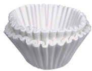
FILTERS, 20x8 252/CS 36/CL