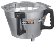
FUNNEL ASSY W/ BASKET, TITAN